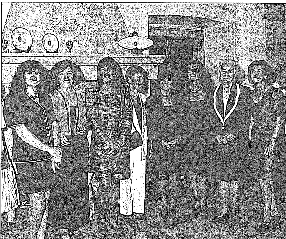
Coimbra Conference. Our Portuguese hosts